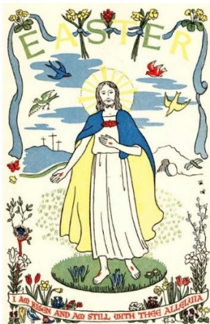
He is Risen - Alleluia!

ACT OF SPIRITUAL COMMUNION: † (TO SAY WHEN YOU ARE WATCHING MASS) MY JESUS, I BELIEVE THAT YOU ARE PRESENT IN THE MOST HOLY SACRAMENT. I LOVE YOU ABOVE ALL THINGS, AND I DESIRE TO RECEIVE YOU INTO MY SOUL. SINCE I CANNOT AT THIS MOMENT RECEIVE YOU SACRAMENTALLY, COME AT LEAST SPIRITUALLY INTO MY HEART. I EMBRACE YOU AS IF YOU WERE ALREADY HERE AND UNITE MYSELF WHOLLY TO YOU. NEVER PERMIT ME TO BE SEPARATED FROM YOU. AMEN.